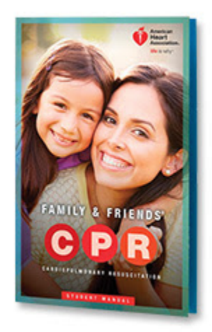
Student Manual--$2 each

The brand-new Family & Friends® CPR course materials are in stock and shipping now! Please contact our office to place your order!